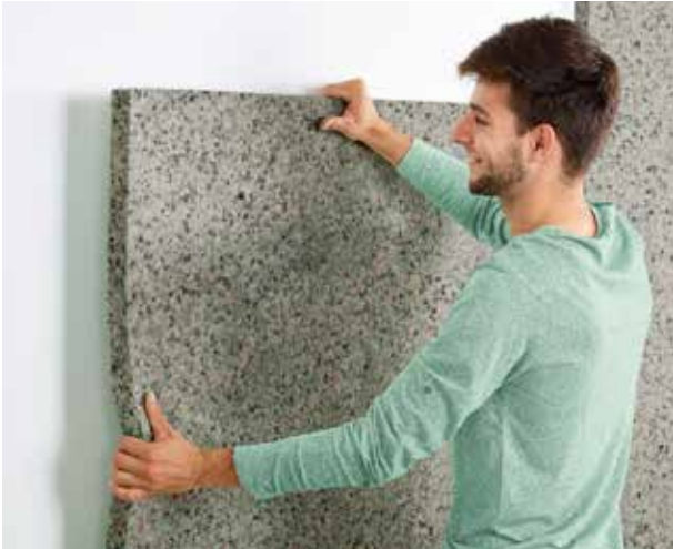
Positioning of the panels before applying glue.